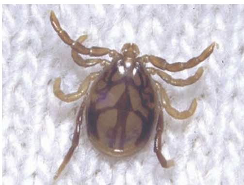
The Paralysis Tick affects the nervous system of animals, which can lead to death. But help is at hand.